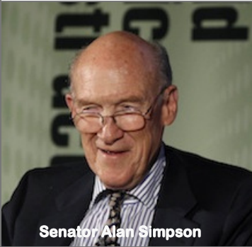
Senator Alan Simpson

"Alan Simpson and his senior-citizen-hating ways are back in the news. It will come as a shock to most Social Security recipients to find out that Social Security isn't a retirement program. And that a former Senator who was chosen by the President to lead an important government commission has so much contempt for government programs. WASHINGTON—Alan Simpson's cold relationship with AARP is no secret, but the former Republican Senator from Wyoming took it to a new level Friday. At an event hosted by the Investment Company Institute, Simpson delighted the finance industry audience members by aiming a rude gesture at the leading lobby for senior citizens....Simpson's forceful gesture came after an extended diatribe against Social Security, which he said is a "Ponzi" scheme, "not a retirement program."