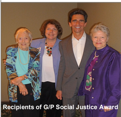
Recipients of G/P Social Justice Award

Speak your mind even if your voice shakes. Well aimed slingshots can topple giants. -- maggie kuhn, founder